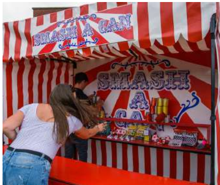
Carnival Fun Fair