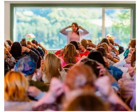
Self Care Masterclass