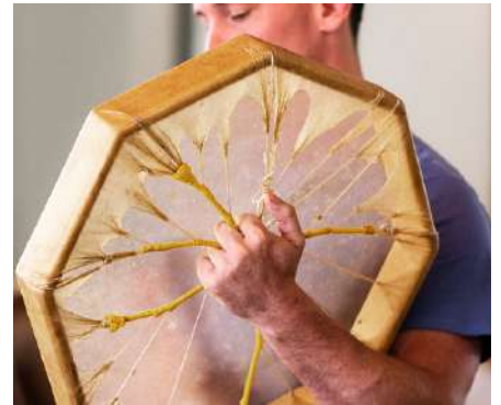
Shamanic Drumming Journey & Teachings