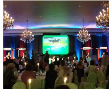
Night at the Races