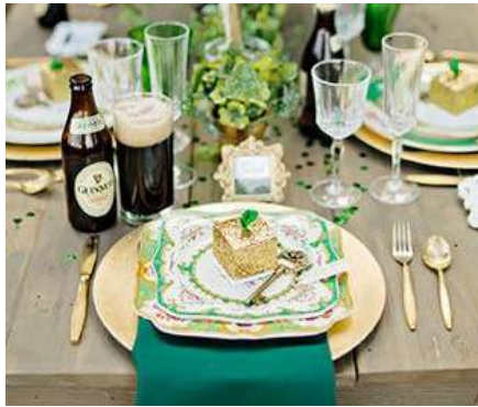
St. Patrick's Day