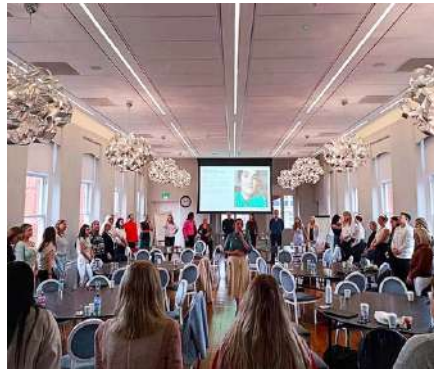
Self Mastery & Authentic Leadership