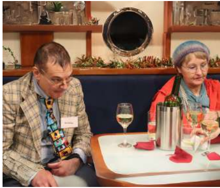
Murder Mystery Dinner