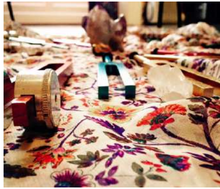
Sound Bath Experience